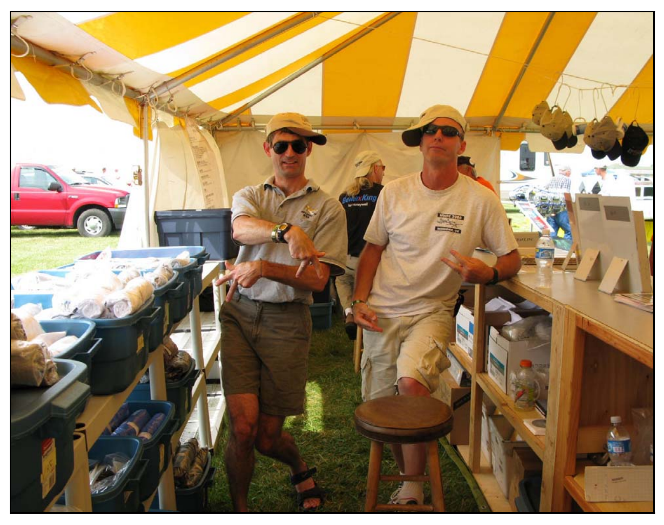
Gang activity has increased at AirVenture, despite enforcement efforts. The worst offenders seem to be members of the Keil Road Dork Squad, (pictured) but thousands of members of the "VAF" from branches all over the world have been spotted on the grounds, flashing "colors", speaking gang lingo and swearing fealty to a mysterious leader known as "The Designer."

Rank or position is evidently expressed by the position of the cap bill. Engineers wear it off to the left, tech help members wear it off to the right. Ringleaders wear it straight back — see background. Those who wear it straight ahead are simply low-level drones (except for The Designer, who is thought to wear his straight ahead but can supposedly be recognized by his badge of office, reported variously as a bag of grapes or a cup of iced tea.